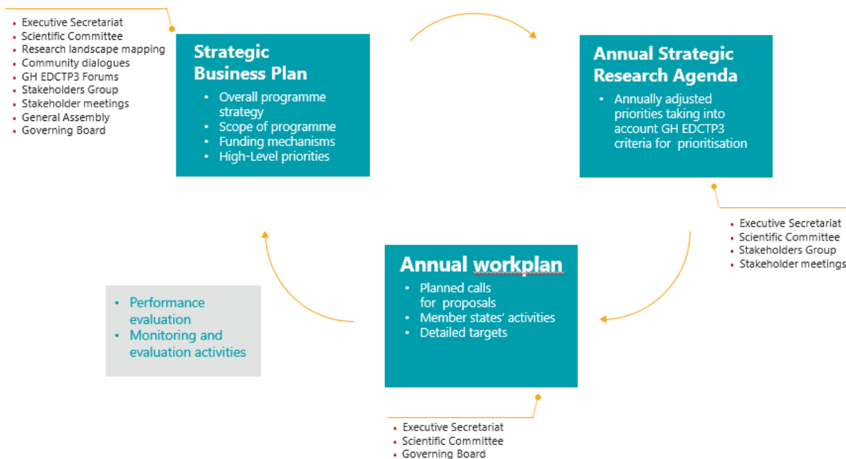
Figure 3: Global Health EDCTP Priority-setting mechanisms

The broad priorities outlined in this SRIA will form the basis for the annual work plans (Figure 3). Annual plans will include details of the specific calls for proposals for the following year.