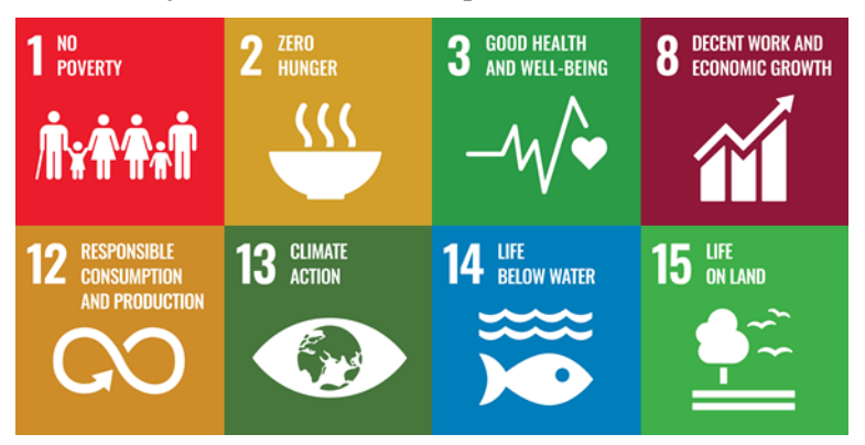
Figure: Major Sustainable Development Goals in relation to PAHW

Since the challenges described above are not restricted to the European continent, networking with international projects and initiatives will be sought and international cooperation developed as much as possible. Interaction with international stakeholders such as OIE, FAO, WHO and UNEP, as well as international research alliances such as STAR-IDAZ International Research Consortium will enable such cooperation.