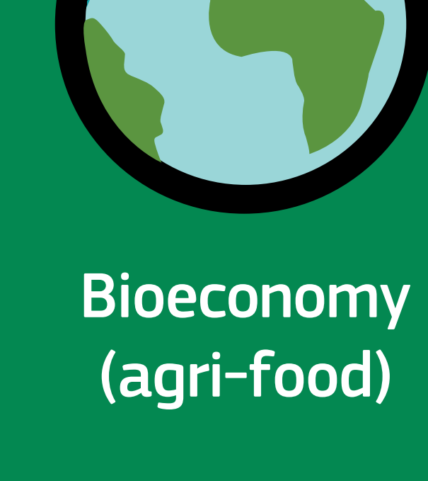
Earth and marine