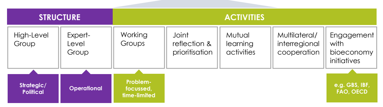
Figure 1: Intervention logic for the European Bioeconomy Policy Forum. The permanent structure, highlighted in purple, will be supplemented, as required, by ad-hoc, time-limited Working Groups convened to work on a specific problem.