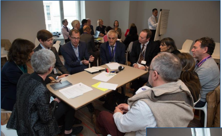
Participants discussed key challenges and solutions for each of the workshop thematic areas in focussed break-out groups.

This report follows the workshop structure and is written in four parts. The first provides background and objectives. The second is a summary of the presentations and hence the 'state of the art' in each of the three workshop themes. The third part lays out the key challenges, non-technical barriers, research needs and short terms actions, resulting from group discussions amongst the workshop participants. The final part is a list of recommendations for the Commission on short term communication and direct financial support to increase the current 10% of global food production from aquatic sources.