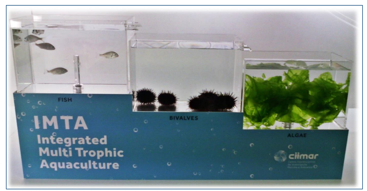
An educational kit to show the principle of Integrated Multi Trophic Aquaculture – SeaChange Project – funded by the European Union's Horizon 2020 Framework Programme for Research and Innovation (grant agreement 652644).

Other examples from various European countries were also presented as good models.